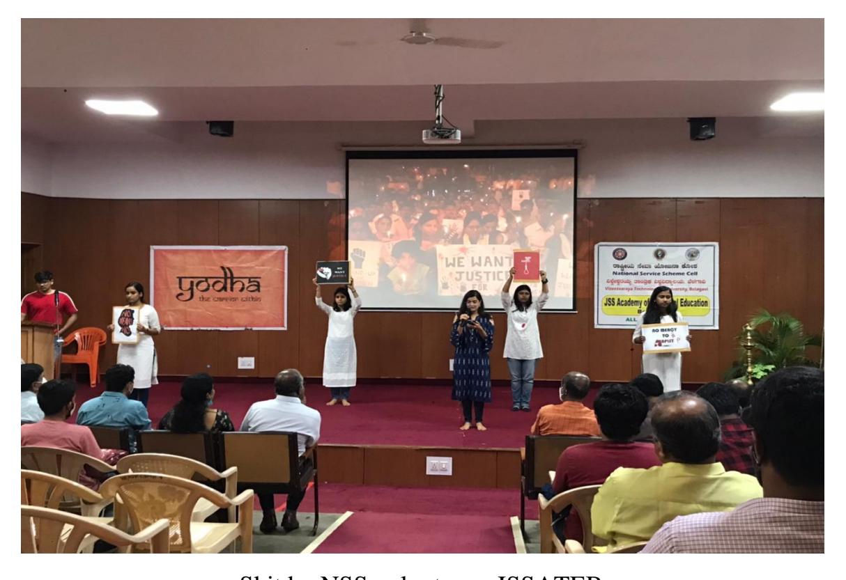
Skit by NSS volunteers, JSSATEB