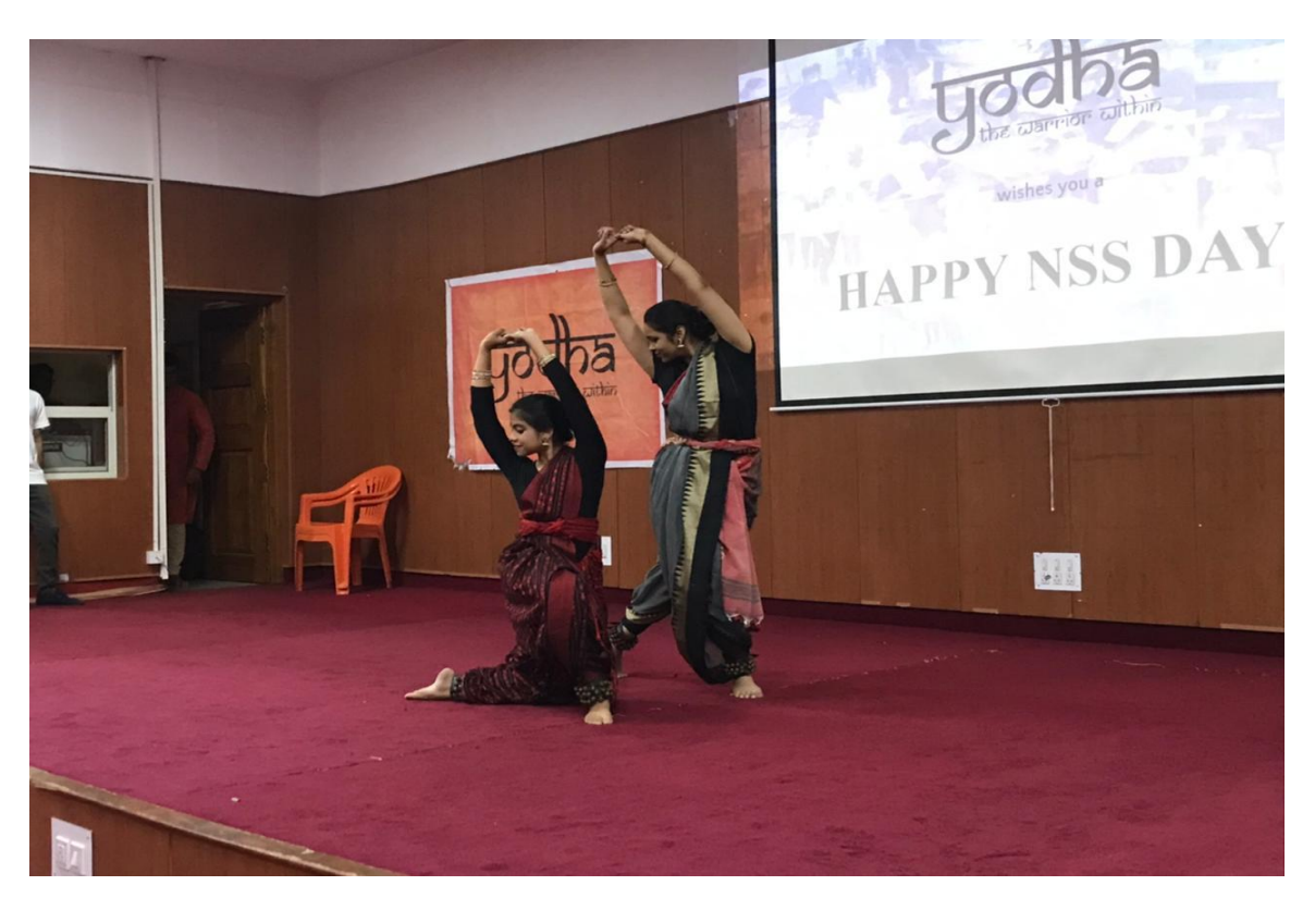
Dance by NSS volunteers, JSSATEB