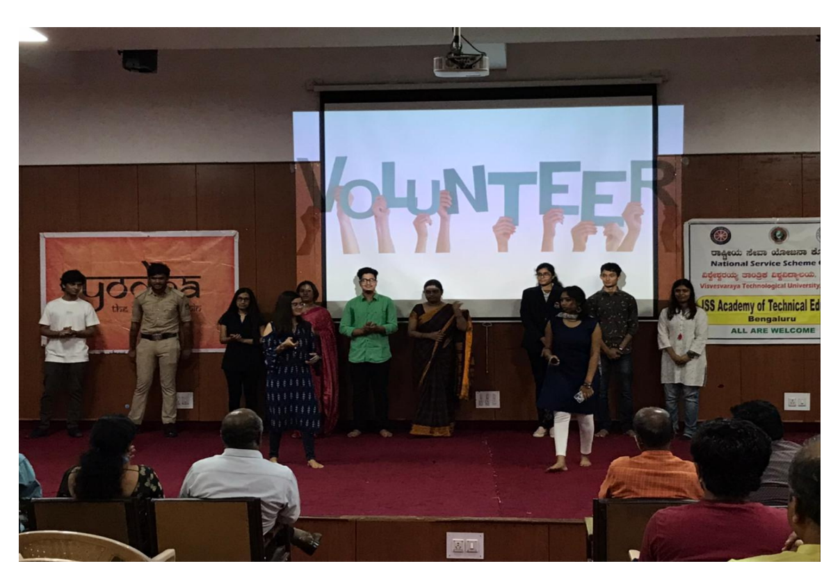
Skit by NSS volunteers, JSSATEB